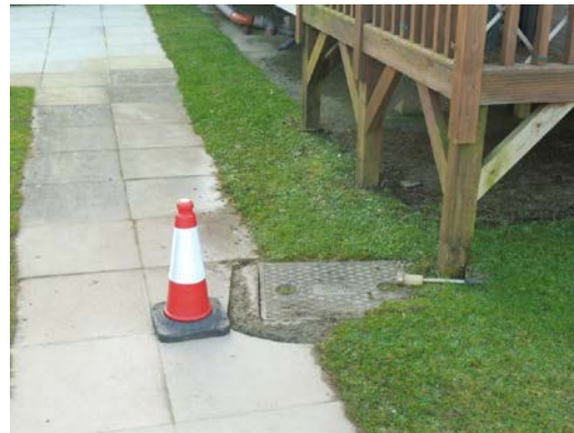
Potential leak location at Cardigan 9 (need to confirm when leak at Cardigan 19 has been repaired)