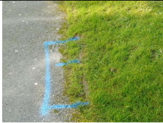
Leak location at Clwyd 25