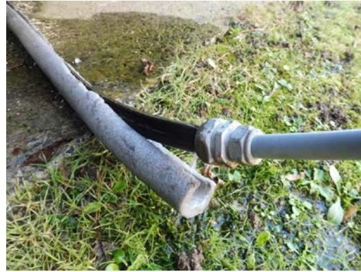
Leak on fitting Pembroke 25