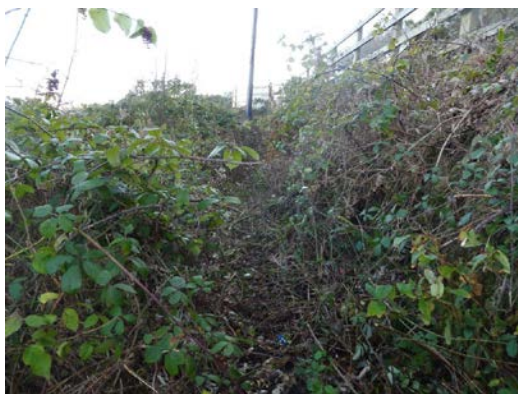
Meter 98765432 location - in brambles