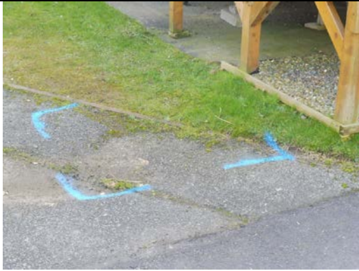
Leak location at Cardigan 19