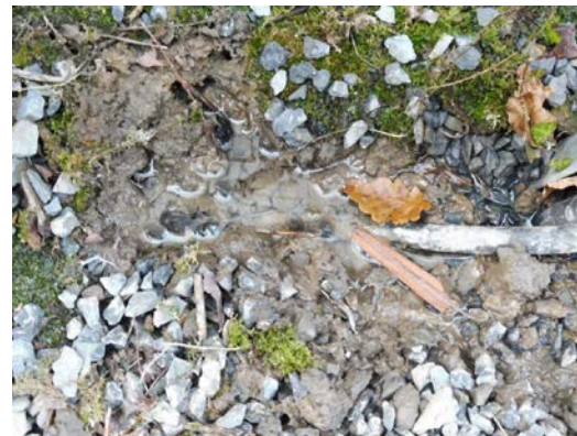
Minor leak at Teifi 42