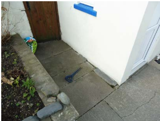
Leak location at Traethgwyn Cottages