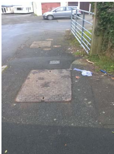
Main Meter location