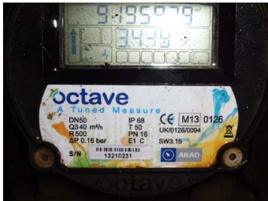
Main Meter – MSN: 12345678

Most areas of the park are supplied with water from several storage tanks and pumps located around the park.