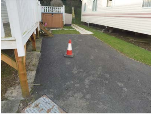
Potential leak at Powys 10 – isolate mains in this area if possible, to check water flow in drain has subsided, or trace out pipework