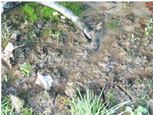
Minor leak at Hengell 28