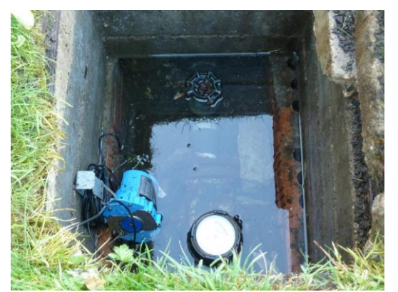
Water in chamber (level drops when gate valve closed)