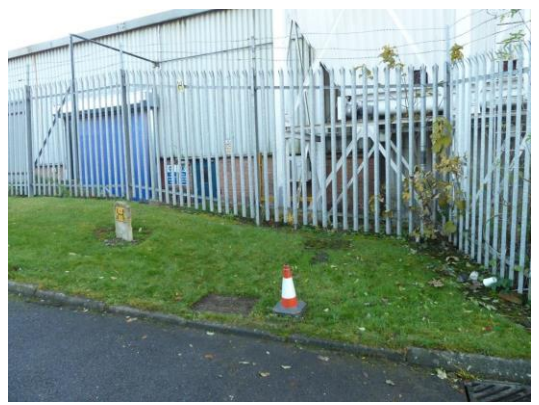
Meter location in grass verge

Where the pipework reaches the park, there is a main isolation valve (wheel valve) that isolates all pipework on park - this is located adjacent plot 32. This was confirmed by a few residents from around the park whose water pressure diminished when this valve was closed.