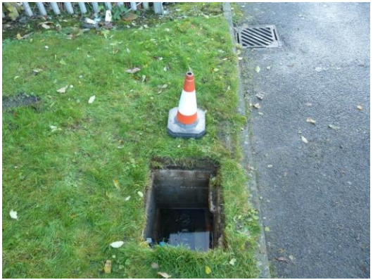
Leak location behind water meter (traffic cone)

When checked, there was a high level of leak noise on the pipework in the meter chamber. With the valve behind the meter closed for a short period, the water level in the chamber was found to drop quite quickly. A chlorine residual test confirmed mains water immediately. The chamber was completely dewatered before opening the valve again. Water started filling the chamber within a few seconds.